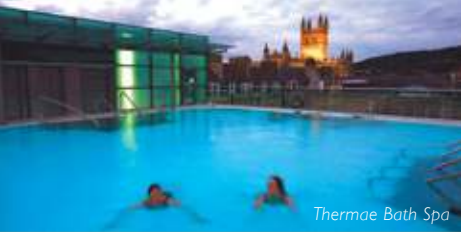
Thermae Bath Spa